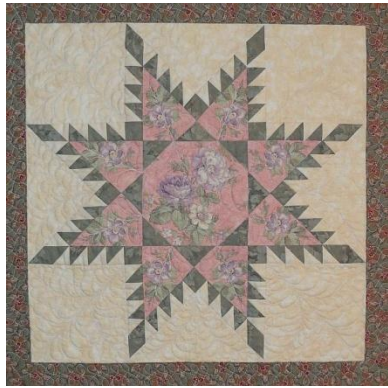
Feathered Star Traditional Setting 20" block