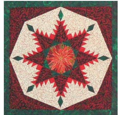
The New Feathered Star Set on octagon point, 22" block

Explore the fun of making the classic Feathered Star faster and more easily using Quick-Strip Paper Piecing for the feathers. Choose the Traditional Setting, left, or set the block on the octagon point, right, for the "New Feathered Star" option.